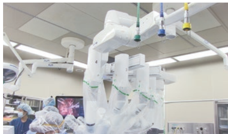
Fig. 2 | Patient cart and ceiling-mounted OR light

Poles and arms of OR lights often obstruct robot movement (Fig. 2).