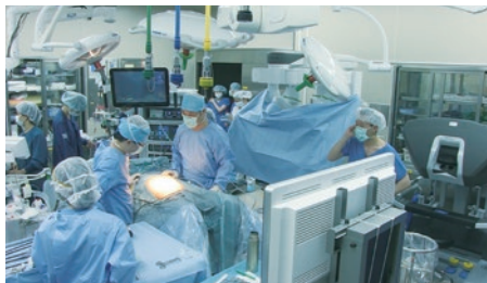
Fig. 1 | Operating room with robotic surgery port installed

However, what really takes up the largest area is the OR light.