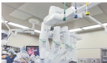
Fig. 2 | Patient cart and ceiling-mounted OR light

Poles and arms of OR lights often obstruct robot movement (Fig. 2).