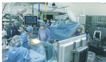
Fig. 1 | Operating room with robotic surgery port installed

However, what really takes up the largest area is the OR light.