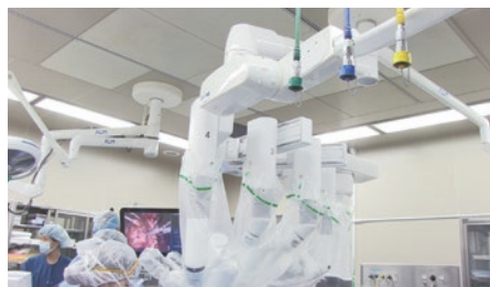
Fig. 2 | Patient cart and ceiling-mounted OR light

Poles and arms of OR lights often obstruct robot movement (Fig. 2).